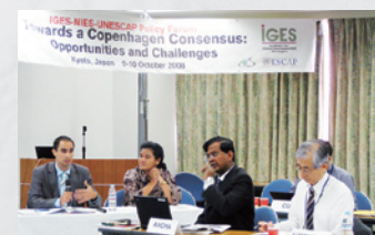
Consultation in Kyoto (2008)