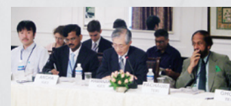
Consultation in India (2007)