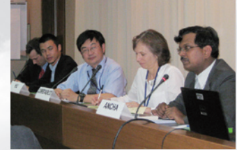
The US-Japan Workshop on The Co-benefits of Climate Actions in Asia