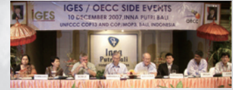
COP13 side event in Bali